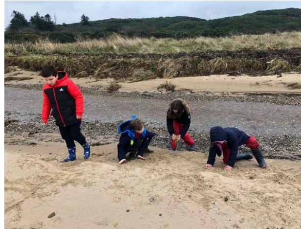
Science at the beach

We are continuing to use the outdoors as a key part of our curriculum